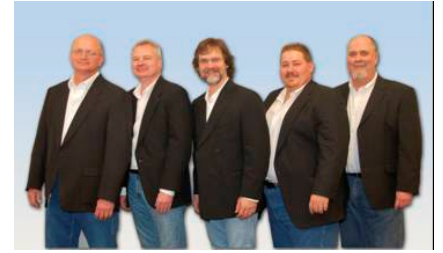
Jerry Butler & the Blu-J's